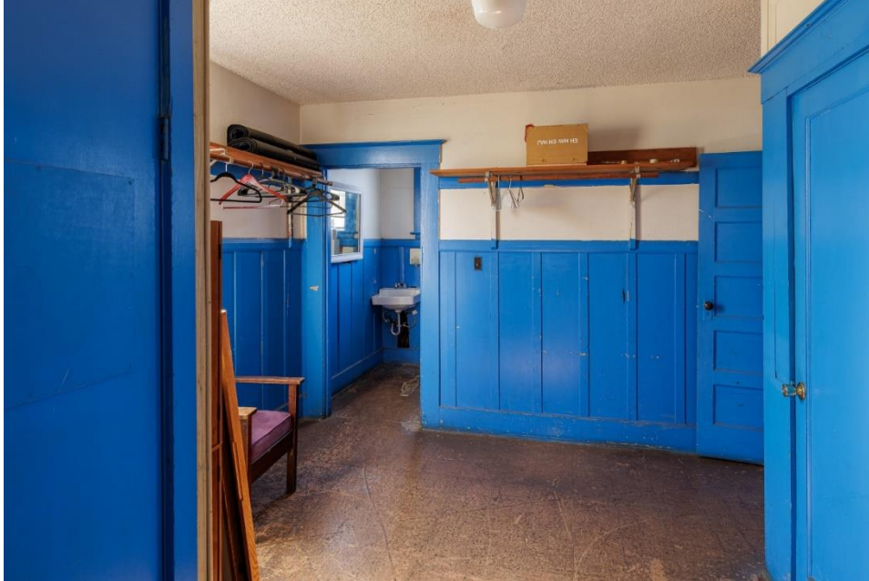
Photo 16 Second floor, looking west across meeting hall