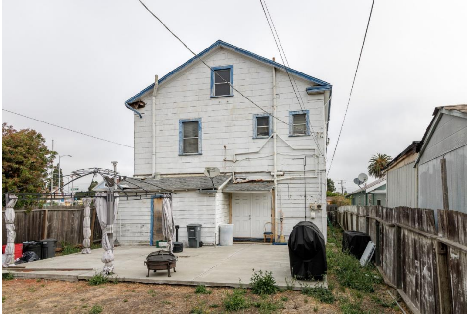
Photo 8 Oblique view of west (left) and rear (right) elevations, looking northeast from unnamed alleyway at southern periphery of property