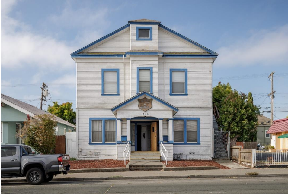
Photo 2 Upward view of the primary (north) façade showing projecting details, looking southeast from front yard