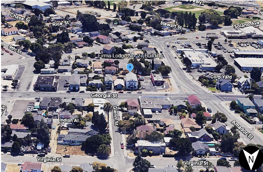
Figure 6 Property Boundary Map, Source: Assessor Division, Solano County Property Map; edited by Page & Turnbull, 2025