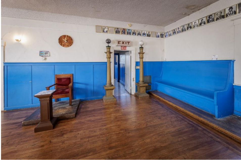
Photo 18 Second floor, looking north to Worshipful Master's Chair on a raised platform from center of lodge room