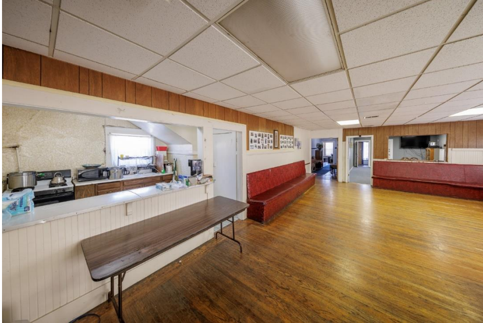
Photo 12 First floor, looking southeast across dining room