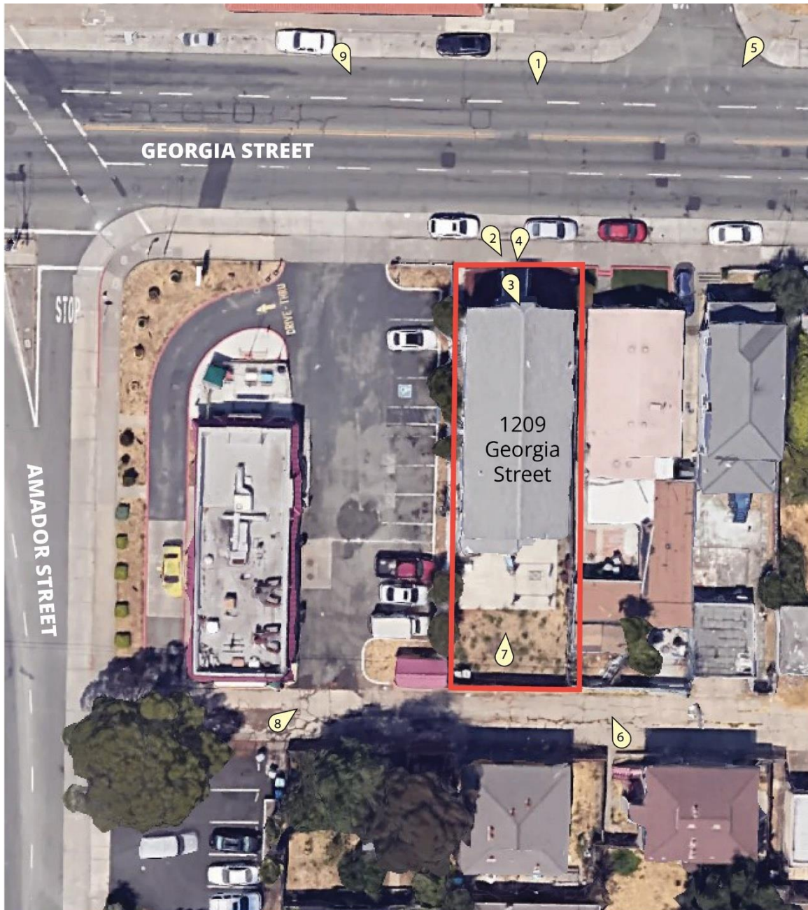
Firma Lodge No. 27 Building Photographic Key Map