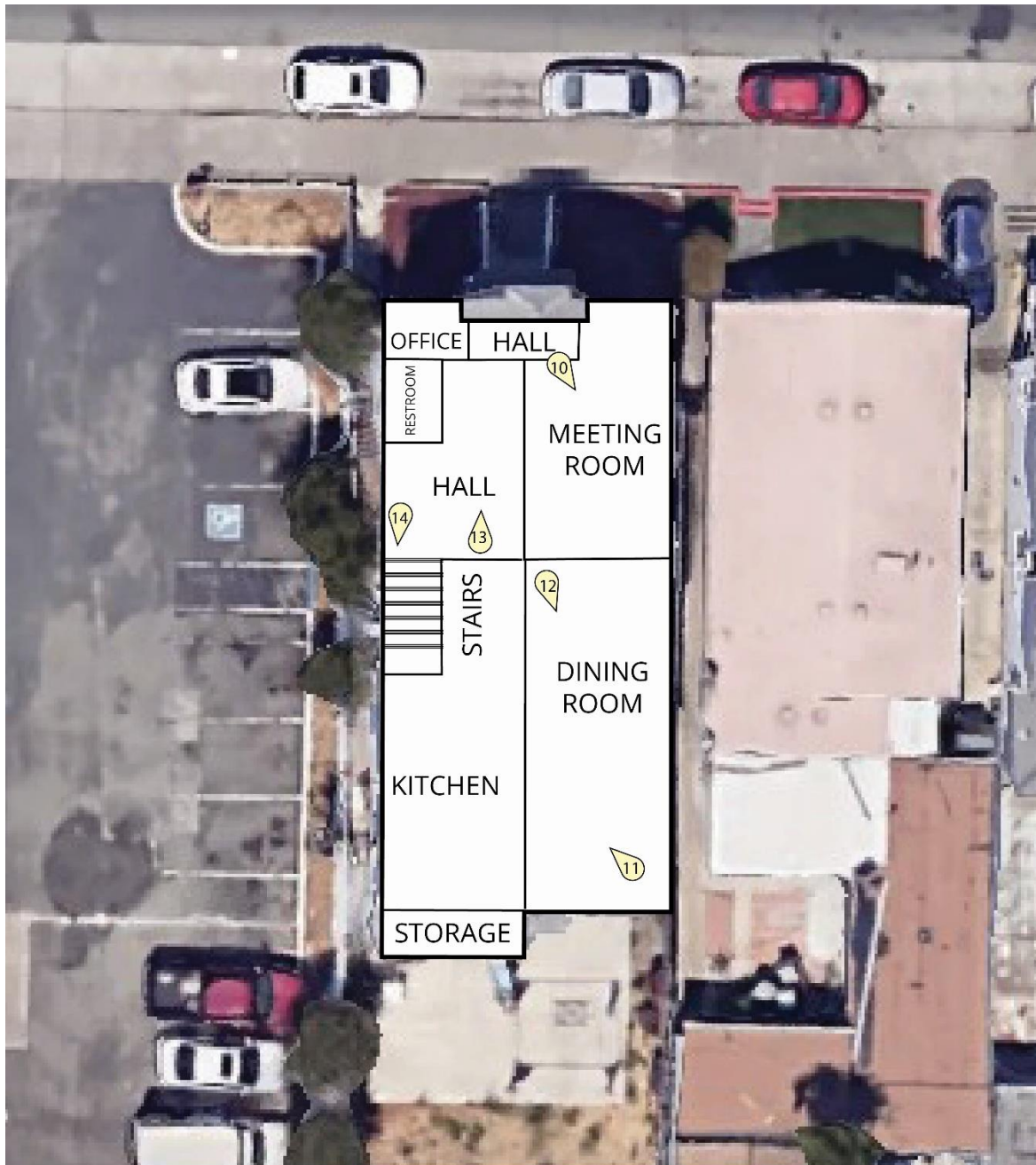
Firma Lodge No. 27 Building Photographic Key Map - First-floor Interior