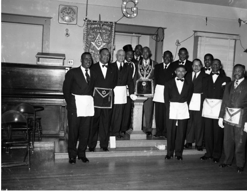
Figure 4 Prince Hall Masons Firma Lodge No. 27, circa 2000